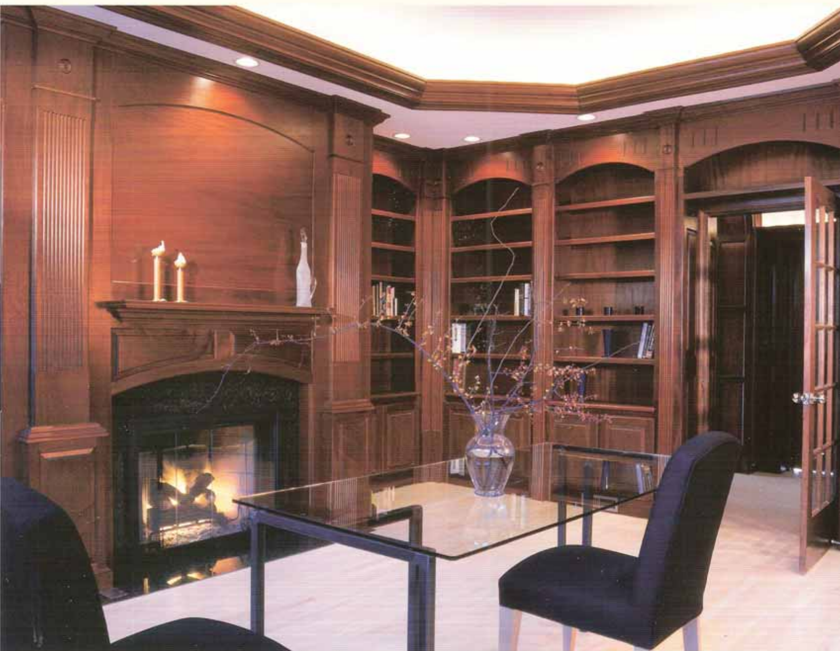
Custom-built mahogany library has a secret door leading into the media room.

lowing endorsement: "The entire project ran smoothly. We even moved in about six weeks ahead of schedule! We are very happy with our new home and happy we chose Marc Kaplan to be our builder."