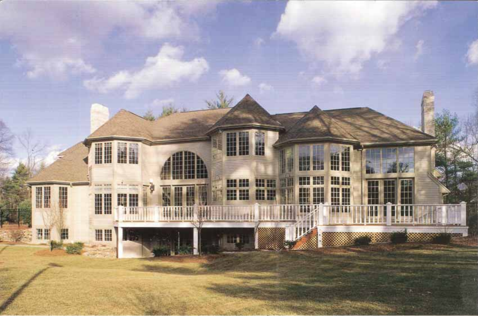
Scholz Design.