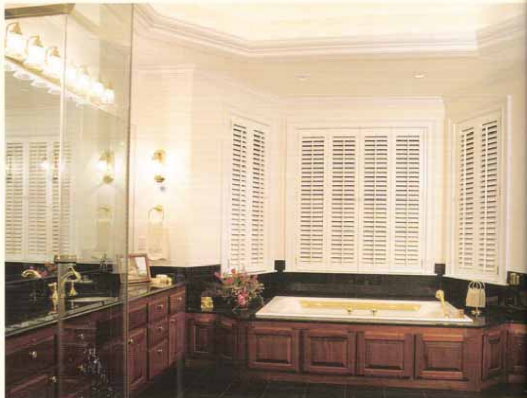
This bathroom features a tray ceiling, mahogany cabinetry, and black granite.